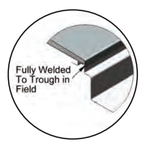
PAN EDGE DETAIL